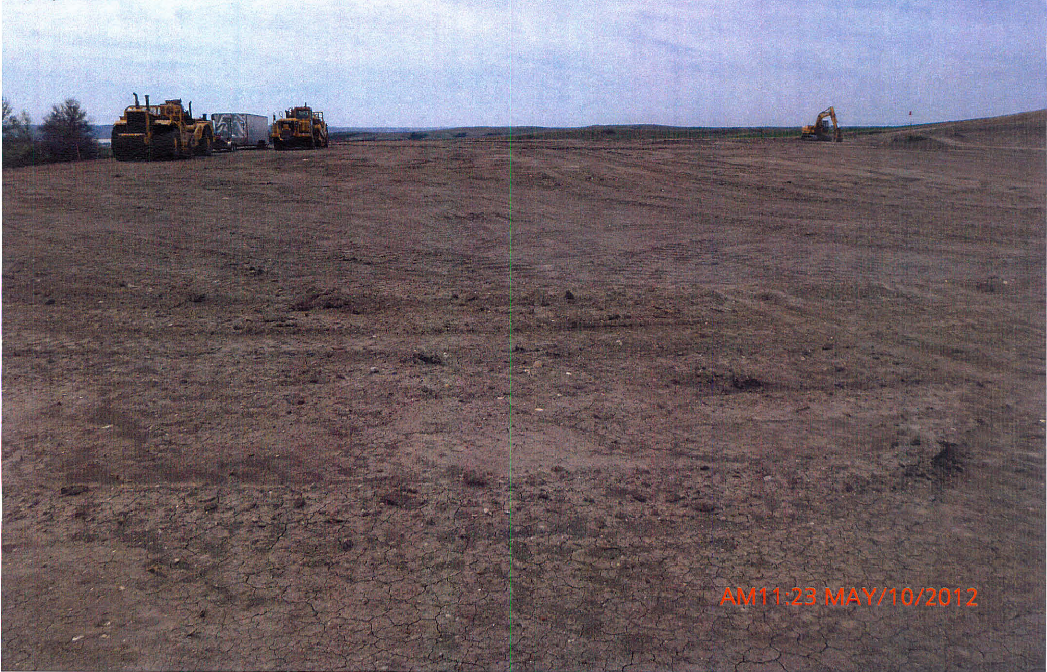
Photo #6 - Looking South at the oil pad being constructed for P Jorgenson 5-14H Well on Section 14-154-98. Dirt work is still being completed, no scoria or gravel has been placed on surface. 2 scrapers and 1 track hoe was on site but nobody was on site operating the equipment.