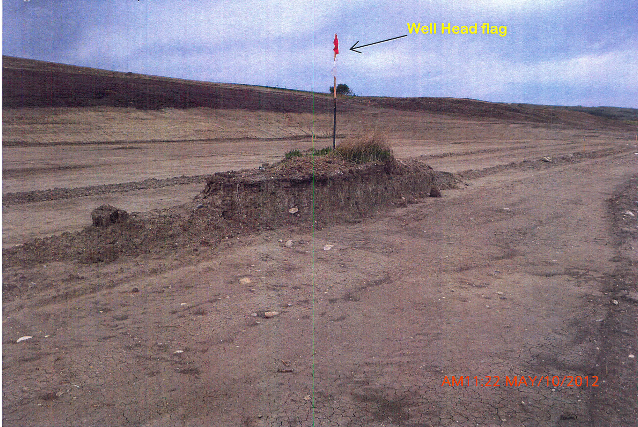
Photo #5 - Looking NW at the well head flag located at 48.16396N, 103.25857W for P Jorgenson 5-14H Well on Section 14-154-98. Dirt work is still being completed, no scoria or gravel has been placed on surface.